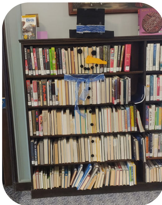
Groton Public Library made this adorable snowman using books in their stacks!