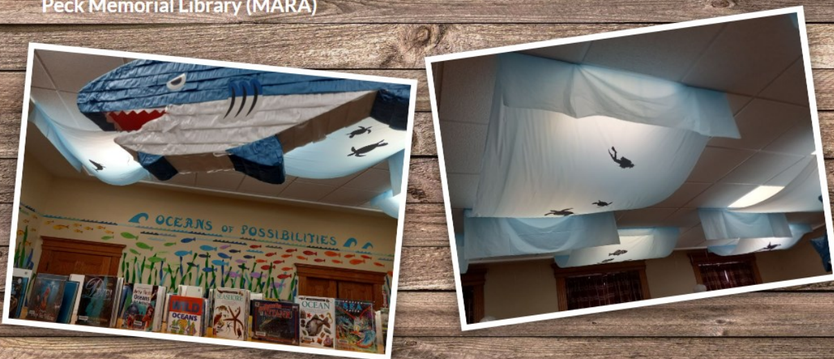
Peck Memorial Library (MARA)