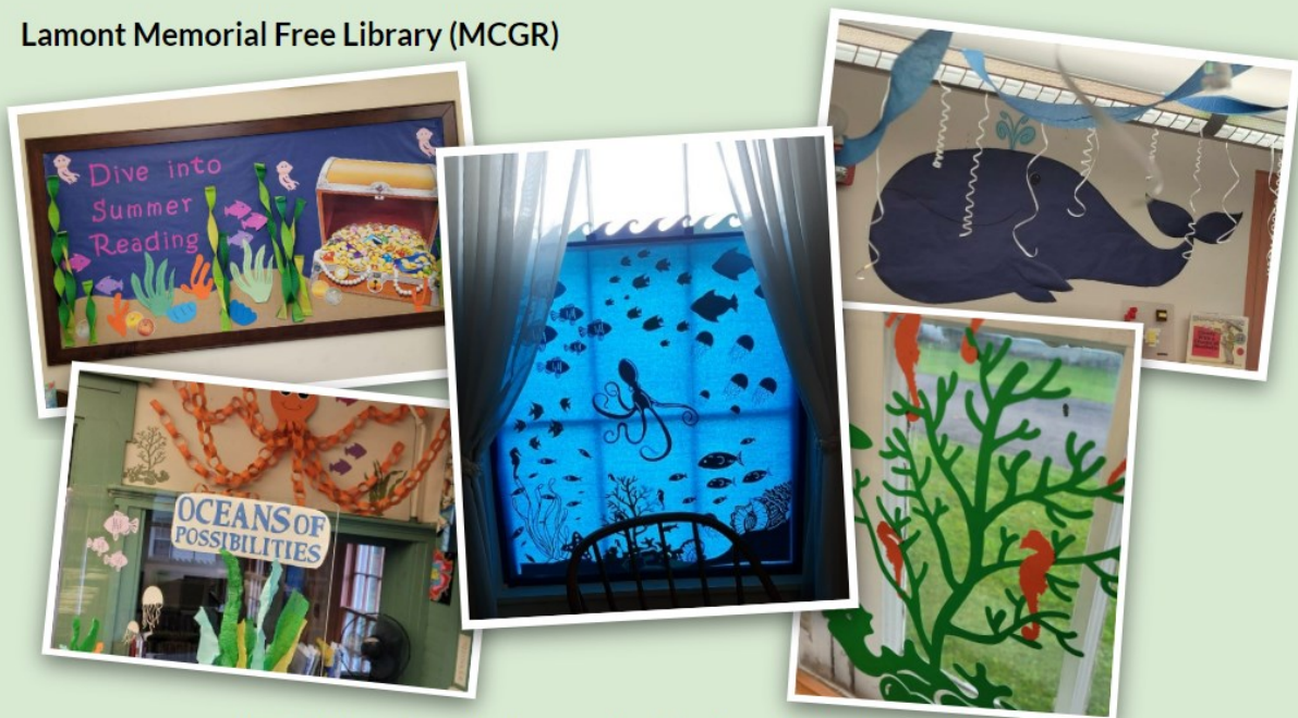
Lamont Memorial Free Library (MCGR)