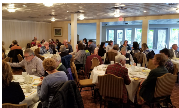
FLLS 2019 Annual Meeting held at the Shepard Hills Country Club in Waverly, NY. We are hopeful that next year we'll be able to meet in person.

Your budget is required to be easily accessible to the public and posted on the library's website.