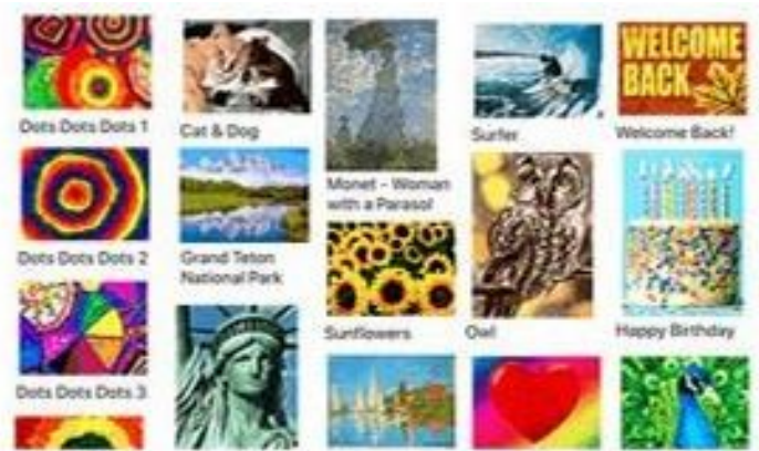
Sample images. Access the full gallery after you redeem your code.

Once the image is selected, you can retrieve the unique 'invitation' link that provides access to your private Stickerboard. Simply share this link with your group. There is no sign-in required for members of your group to add stickers to your Stickerboard. Only those who receive the link can add to your stickerboard.