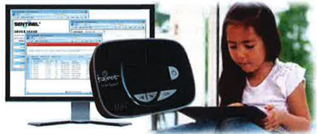
The portable Kajeet SmartSpot and Sentinel Portal allow for complete control of the student's off-campus academic Internet experience