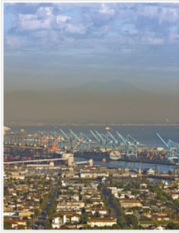
California air pollution and greenhouse gas emissions in urban areas, such as Los Angeles, are...

Human beings rely on air to live and breathe, yet they are also largely responsible for creating the pollution that makes that air unhealthy for themselves and all living things. Air pollution is caused by the release of toxic or damaging particles and gases into the atmosphere. While few scientists disagree that air pollution poses a serious threat to the environment, policy makers and citizens are often at odds as to how to address the problem. There are a variety of causes of air pollution. As humans burn the fossil fuel that powers cars and heat homes—fuels such as natural. View More