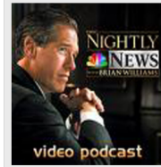
Not So Green?: Biofuels May Be Worsening Carbon Dioxide...