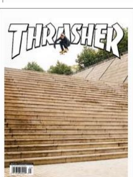
Thrasher Skateboard Maga...