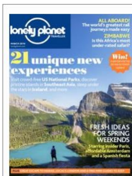
Lonely Planet Traveller