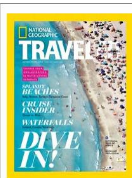
National Geographic Trav...