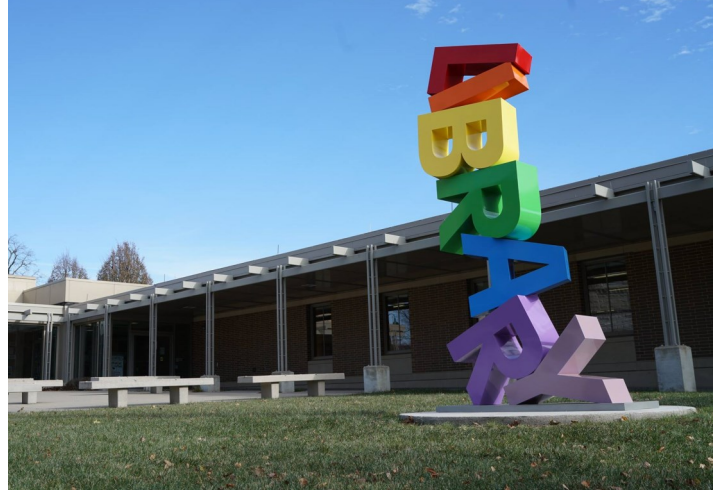
A former Ithaca artist created this cool sign for his local library in Iowa: www.facebook.com/mcguiremade/posts/1412159248882983