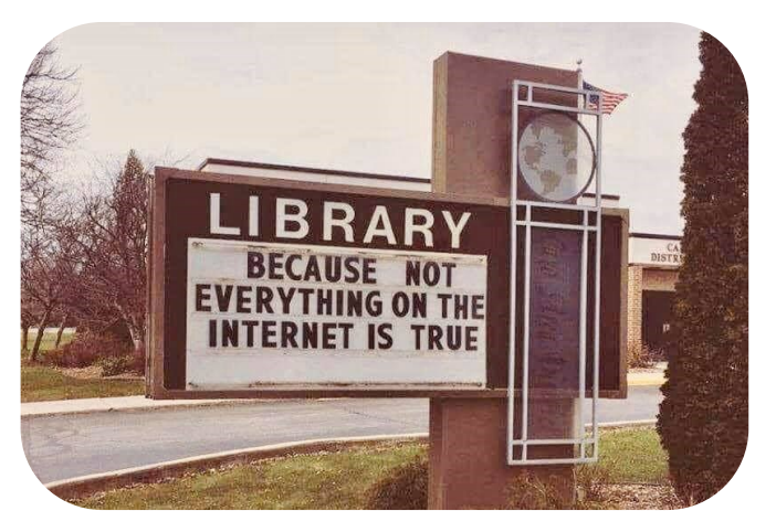
Image Text: LIBRARY. Because not everything on the internet is true. Original post can be found: https://bit.ly/3jkySM5