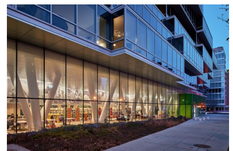
West End Branch